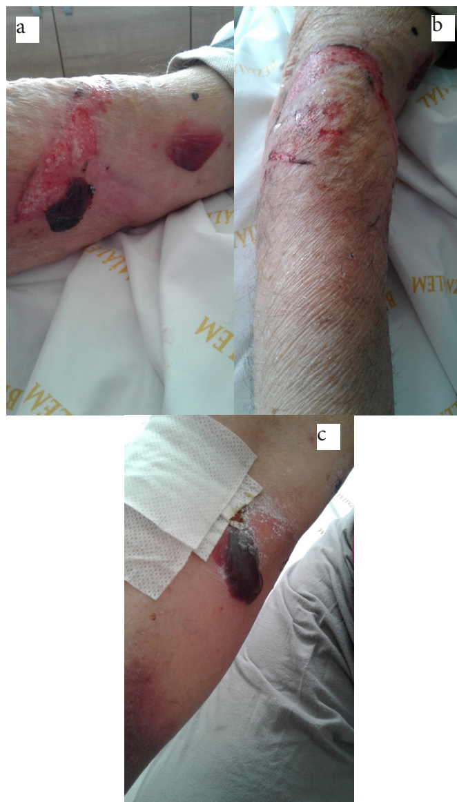
Figure 6. (a, b, c): Bullous drug reaction, case 11

Case 13: A 40-year-old male presented to our pandemic clinic with a sore throat, fatigue, and chills. He had no travel history, although his daughter was COVID-19 positive. The patient had no known systemic diseases or related medications. His nasopharyngeal SARS-CoV PCR test result was positive, and chest CT showed focal ground-glass opacity in the left lower lobe, consistent with COVID-19 pneumonia. He was admitted and treated with hydroxychloroquine and azithromycin for five days. The patient was discharged in good health; however, an increase in hair growth on the chest, arms, and face was observed, which was suspected to be related to hydroxychloroquine use.