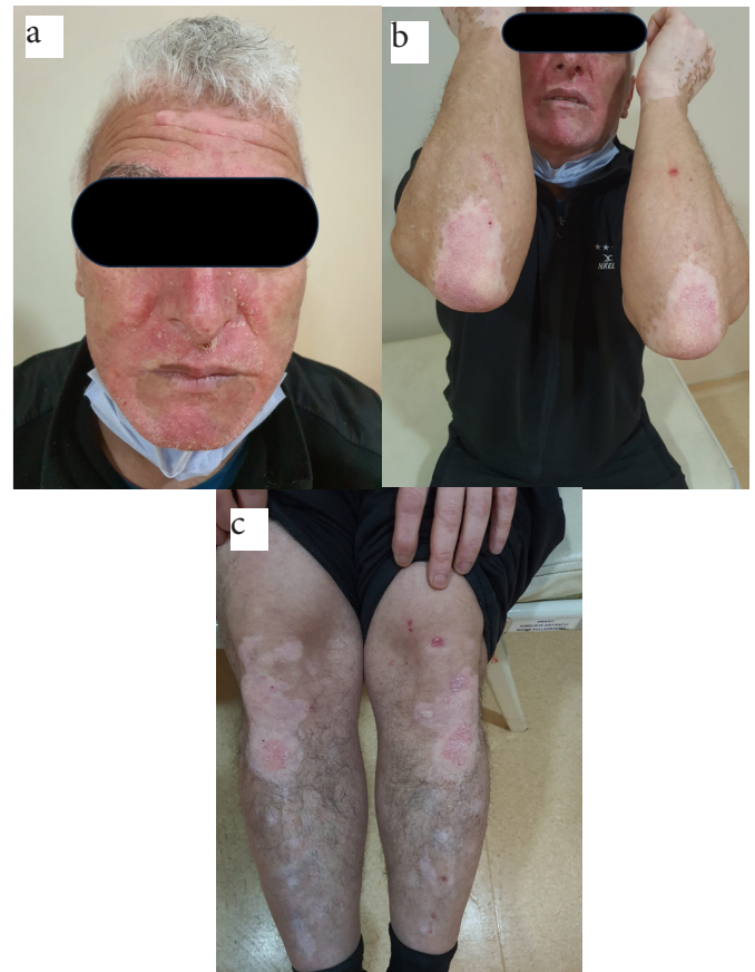
Figure 4. (a, b, c): Psoriasis induced by Hydroxychloroquine, case 9

Case 9: A 46-year-old male presented with fever and cough at our COVID clinic without any travel history or contact with COVID-19 positive individuals. He had a five-year history of vitiligo for which he was receiving topical corticosteroids and tacrolimus. A nasopharyngeal swab PCR test for SARS-CoV showed positive results. Chest CT showed centrilobular emphysema in the upper lobes of both lungs and thin-walled air cysts, consistent with COVID-19 pneumonia. He received a five-day regimen of hydroxychloroquine, oseltamivir, and azithromycin without complications. Five days post-discharge, the patient returned with erythematous squamous psoriatic eruptions on the face and both elbows, which were attributed to hydroxychloroquine (Figure 4). No new medications have recently been introduced.