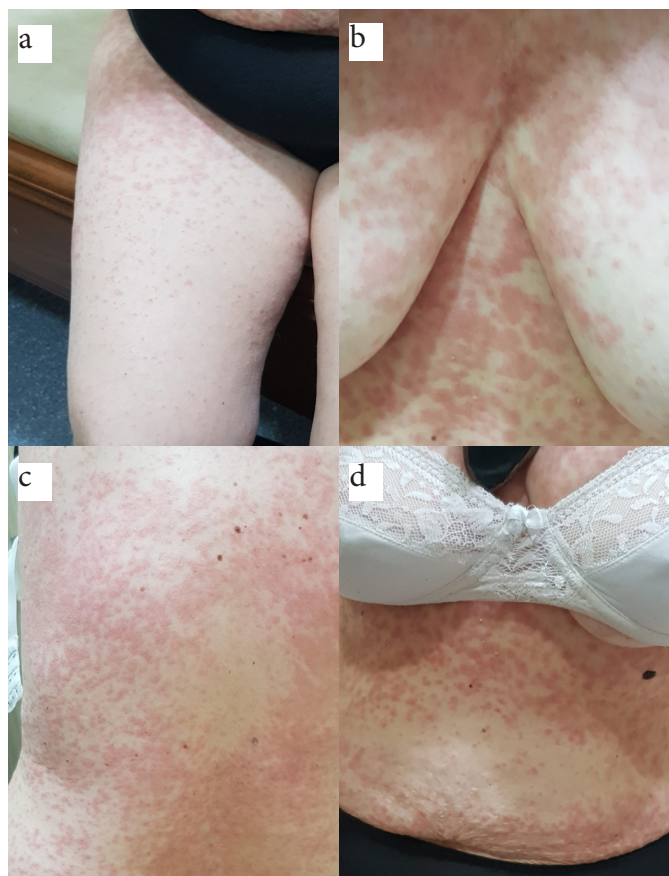
Figure 5. (a, b, c, d): Drug-induced maculopapular rash, case 10

levels. He received a five-day course of hydroxychloroquine and azithromycin and was discharged without complications. Ten days after discharge, he developed bullous drug reactions in his arms, neck, and both lower extremities, which regressed with the application of dermovate cream (Figure 6).